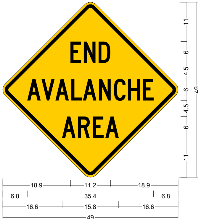
W12-53a End Avalanch Area 36" Across Sides; 36.0" across sides 2.3" Radius, 0.9" Border, 0.6" Indent, Black on Yellow; "END", C 70% spacing; "AVALANCHE", C 70% spacing; "AREA", C 70% spacing;